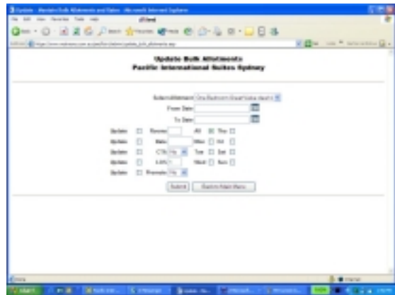
Hotels can easily update rates and allotments in a single step.

The solution is built upon industry standard technologies, ensuring Pacific International Hotels have a foundation which is scalable can adapt to meet their future needs.